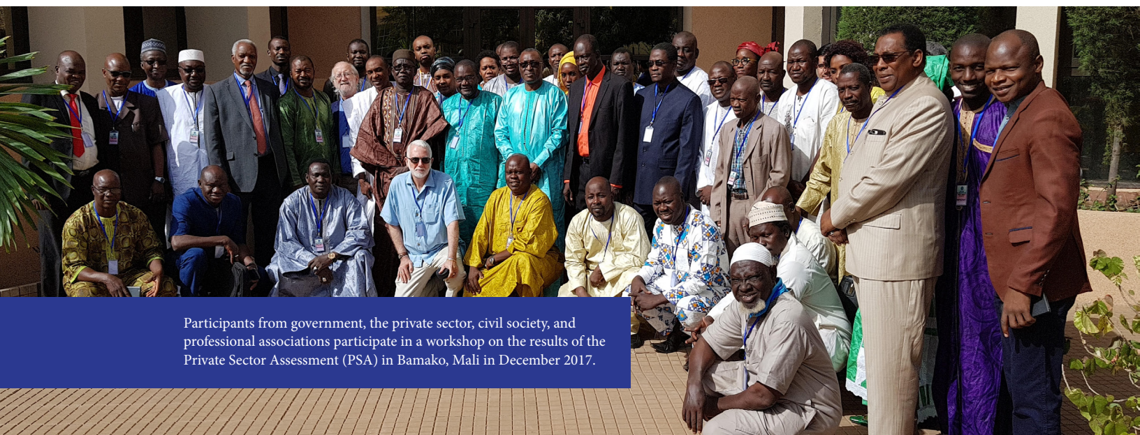
Participants from government, the private sector, civil society, and professional associations participate in a workshop on the results of the Private Sector Assessment (PSA) in Bamako, Mali in December 2017.

This new understanding provides an important foundation for further advancing public-private engagement to improve health in Mali.