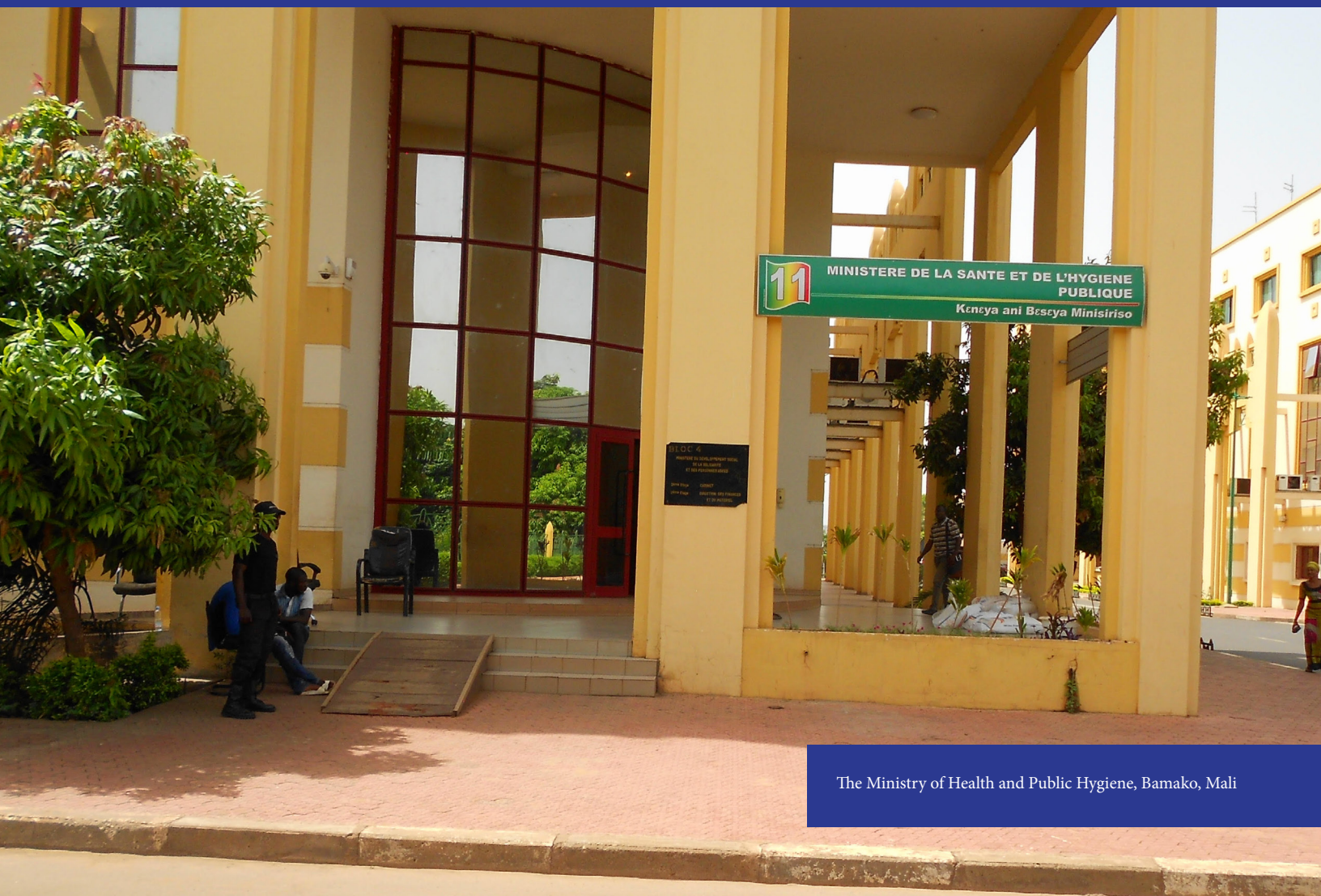
The Ministry of Health and Public Hygiene, Bamako, Mali