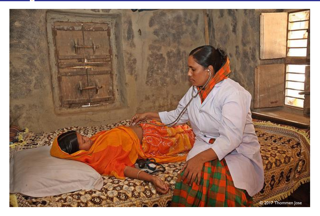
Strengthening Governance to Improve the Quality of Health Service Delivery