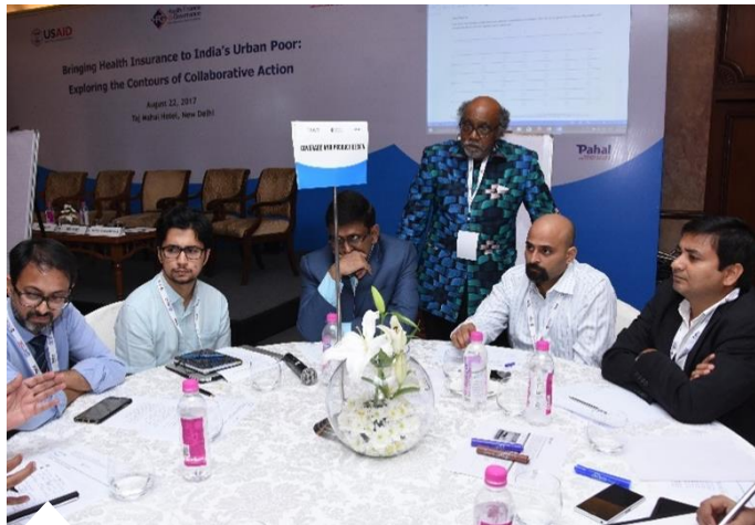
Group 3 discusses issues of coverage and product design