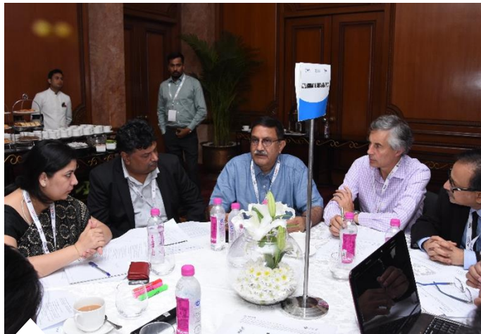
Group I discusses opportunities for leveraging collaborative arrangements