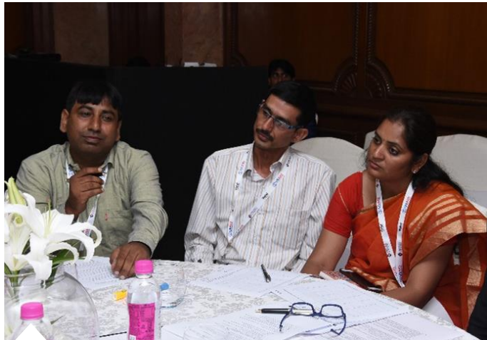
Group 2 discusses strategies to ensure effective service delivery